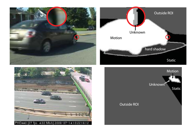
Figure 2. Sample video frames from the Bungalows and Street light sequences and corresponding 5-class ground-truth label fields.

Finding the right metric to accurately measure the ability of a method to detect motion or change without producing excessive false positives and false negatives is not trivial. For instance, recall favors methods with a low False Negative Rate. On the contrary, specificity favors methods with a low False Positive Rate. Having the entire precision-recall tradeoff curve or the ROC curve would be ideal, but not all methods have the flexibility to sweep through the complete gamut of tradeoffs. In addition, one cannot, in general, rank-order methods based on a curve. We deal with these difficulties by reporting the average performance of each method for each video category with respect to 7 different performance metrics each of which has been well-studied in the literature. Specifically, for each method, each video category, and each metric, we report the performance (as